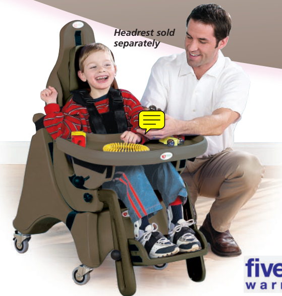
Headrest sold separately

Mobile Floor Base. Built-in tray storage on back. Four swivel casters with rear locks. 10°-25° range of tilt-in space. 🍷 Chocolate Size 9288-04 Small 9288-15 Large