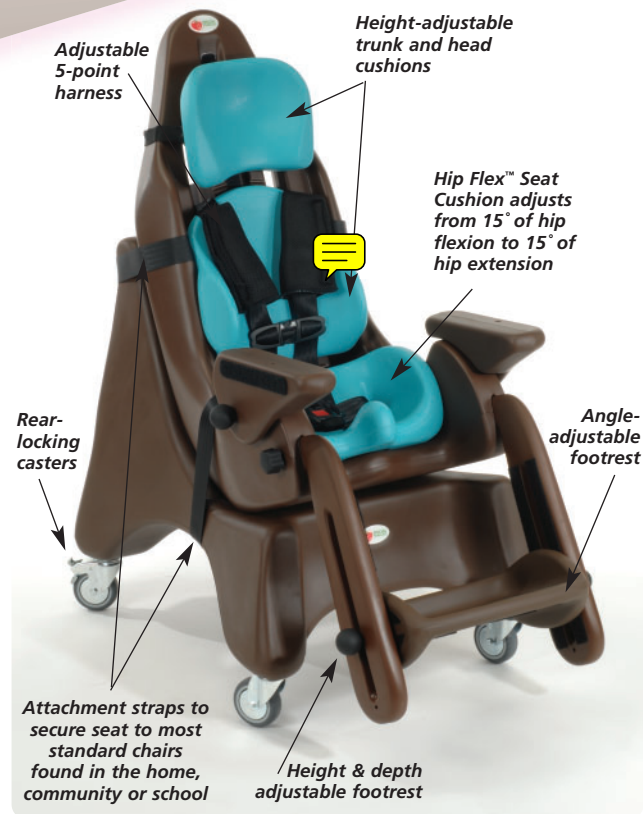
Shown here with Standard Headrest (sold separately)