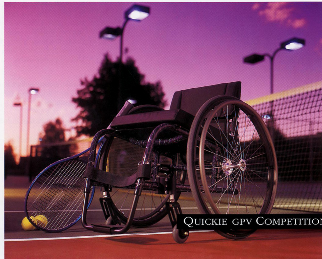
QUICKIE GPV COMPETITION

Think of the Quickie GPV as the sports chair that's built for the toughest game of all: your everyday life.