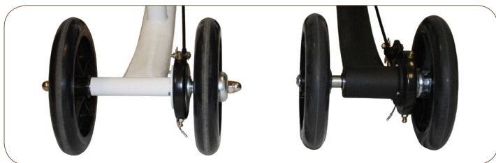
Old Rear Axle