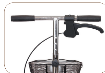
Handle Bar can be Adjusted