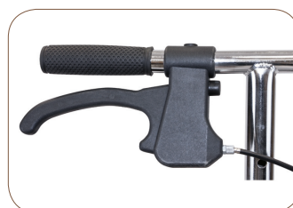
Adjustable Hand Brake