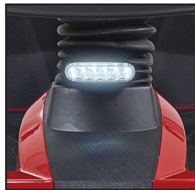
Front and rear LED lights and side reflectors for safety