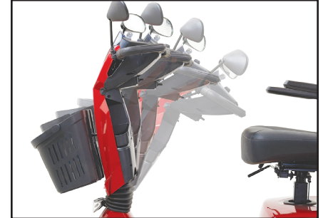
Infinite adjustable tiller with ergonomic design