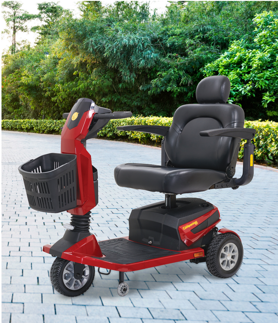
Shown with Power Elevating Seat