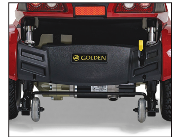
Rear suspension for a smooth ride