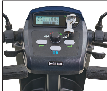
Digital Dashboard & User-friendly auto-tiller adjustment