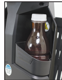
Conveniently located drink holders