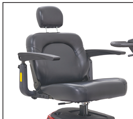
Extra Wide High Back Seat with Headrest for added support & comfort