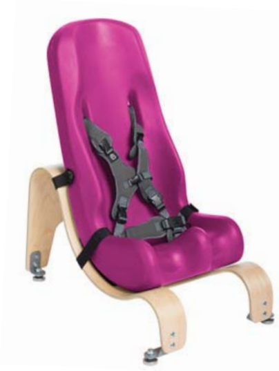
Sitter with Stationary Base