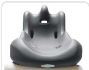
Contoured head and lateral support, shown as top view