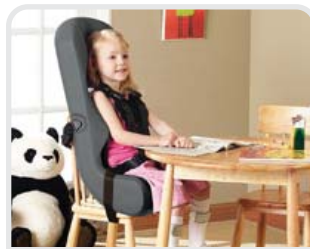
Attachment straps for securing to a standard chair