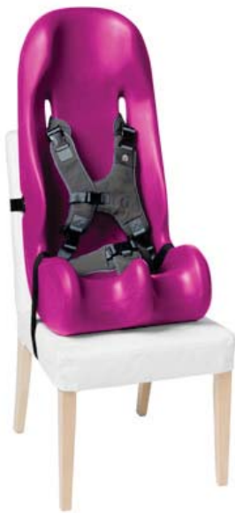
Attach to a chair

Sitters can be used in a variety of ways