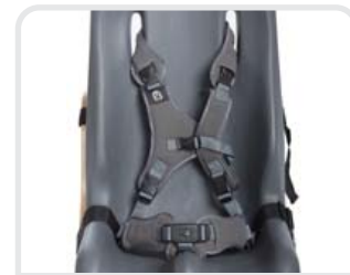
Adjustable 8-point harness