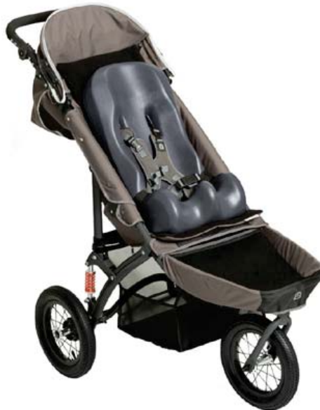
Jogger for Sizes 1,2 (page 22)