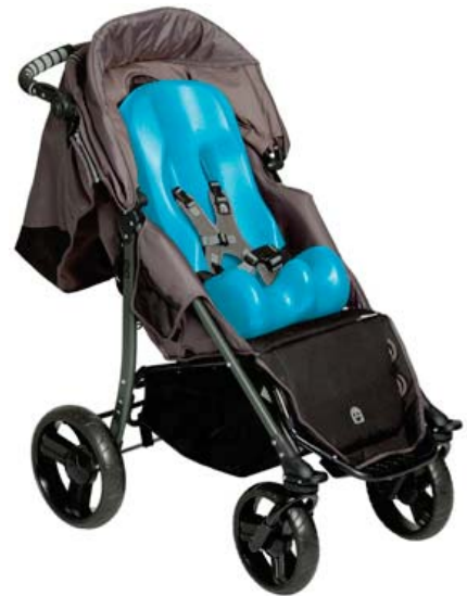
EIO Push Chair for Sizes 1,2 (page 20)