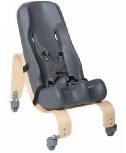
Sitter with Mobile Base