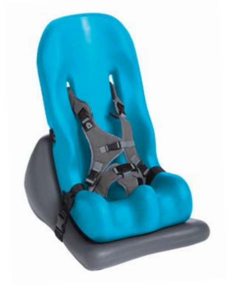
Floor Sitter Kit for Sizes 1,2,3