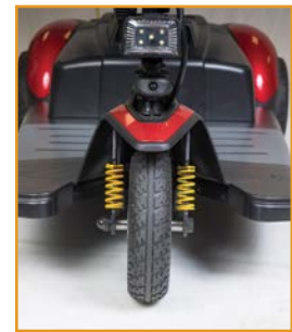
Comfort Spring System