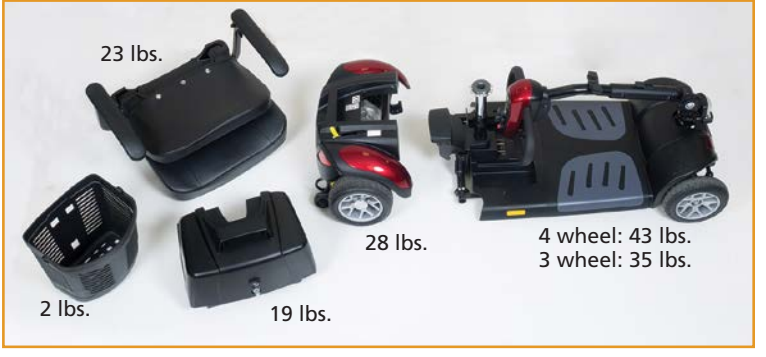
Disassembles into 5 pieces!