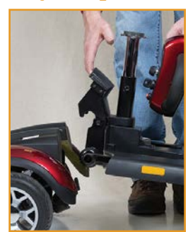
Step 4: Pull forward on the drivetrain release lever to separate the front and rear frame sections!

Step 3: Fold down tiller and lock in place!