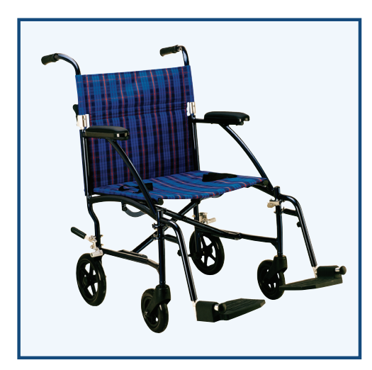
Item # DFL19-BL Shown

It is important for the attendant to be familiar with proper assisting procedures in any situation that requires the use of the Transport Chair. Safety is the Key consideration. Consult your physician, nurse of physical therapist to determine methods most suitable for your individual needs and abilities.